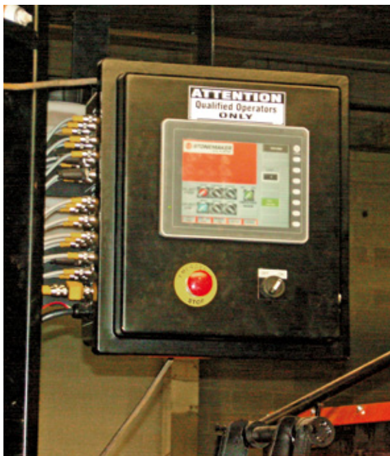
The new control panel allows centralized operating of the machine

Once involved in the project, the trio saw a variety of ways Turck products could be used to improve and streamline the operation of the machine above and